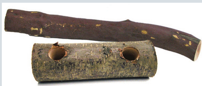
FIGURE 2 | Hardwood saplings and splits are available with predrilled holes that can be filled with acacia gum to promote foraging. Manzanita wood is available in 9-in and 18-in lengths. Custom sizes are also available upon request.

The mice search for the treats and gnaw on the wood instead of fighting with their cagemates.