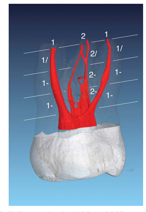
Figure 1 Maxillary second molar depicting a 1-1-1/1 root canal configuration in the palatal and distobuccal roots. The configuration of the mesial root was considered to 2-2-2/2 with an accessory canal in the middle third and a connecting canal between MB1 and MB2 in the apical third.

The described root canal configurations of the mesiobuccal (MB), distobuccal (DB) and palatal (P) roots are shown in Table 1. The most frequently observed root canal configuration in the mesiobuccal root (MB1 and MB2 root canals together) was 2-2-2/2 (19.5%), followed