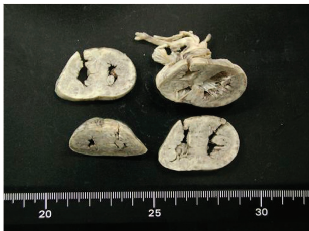
Figure 1. Heart of the 6-day-old GAll patient with a causative novel ETFB mutation showing a thickened ventricle wall and narrow ventricular lumen.