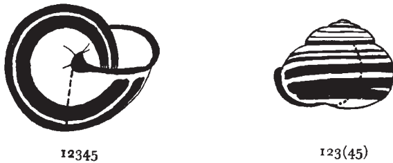
FIG. 2.—Convention used in classifying partial fusing. If fusion extended from the lip to the line shown or beyond, the bands were considered fused.

no bands as 00000. Fusions are shown by bracketing the fused bands. As fusion may begin at almost any time in the growth of the shell, an arbitrary distinction must be made to avoid undue complexities. All bands fused at and after a line drawn across the body-whorl from the umbilicus at right angles to the lower lip of the mouth were considered as fused. This convention is illustrated in fig. 2. In a few specimens (all of them with brown shells) the bands could not be distinguished from the general shell-colour; these were classed as "banding indeterminable." Weakly pigmented bands which are interrupted in several places were represented by colons, and were considered as bands for the purpose of this paper. Bands present only as traces close to the lip were recorded as traces but disregarded for the classification employed here.