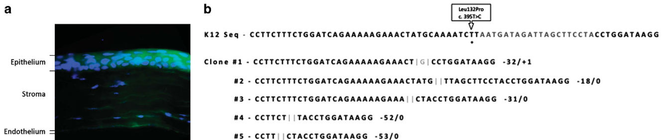
Figure 3. Demonstration of sgK12LP-induced NHEJ in vivo . GFP expression was observed in the corneal epithelium of mice at 24 h post intrastromal injection, demonstrating the efficacy of an intrastromal plasmid injection for transfecting the corneal epithelium (a; N = 2 ). No GFP expression was observed 48 h post injection. Sequencing of the gDNA from human K12-L132P heterozygous mice injected with the sgK12LP construct demonstrated large deletions and the induction of NHEJ due to cleavage of the KRT12 -L132P allele. Of 13 clones sequenced, 5 were found to have undergone NHEJ (b).

sgRNA recognition of its target site and Cas9-mediated cleavage of the exogenous luciferase reporter construct, luciferase mRNA transcription is disrupted and the plasmid becomes functionally silent. Neither NHEJ nor homology-directed repair need occur to observe this effect. Through utilization of dual-luciferase reporter assays, western blotting, quantitative reverse transcriptase-PCR and pyrosequencing the expression levels of wild-type and mutant K12 were quantified at both the mRNA and protein level. The Cas9/sgRNA complex using the SNP-derived PAM was found to be highly potent, similar to that of a positive control KRT12 sgRNA common to both wild-type and mutant alleles, and allele-specific, as demonstrated by no observable knockdown of wild-type K12 expression.