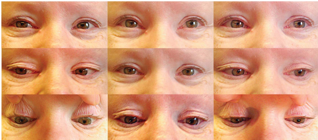
Figure 1 Patient 1 eight positions of gaze.

Her best-corrected visual acuity was 6/6 right eye and 6/9 left eye. Anterior segment examination was normal. The crystalline lens in the right eye was normal however in the left eye showed few refractile dot-like opacities in the nucleus. There was no phacodonesis or subluxation. Posterior segment examination was normal. Cover testing revealed 1 prism dioptre of exophoria for distance with 12 prism dioptres of exophoria for near. Extraocular movements were restricted in all positions of gaze (Figure 3).