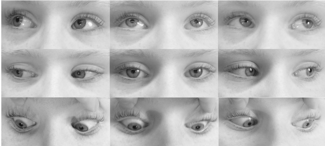
Figure 3 Patient 3 eight positions of gaze.