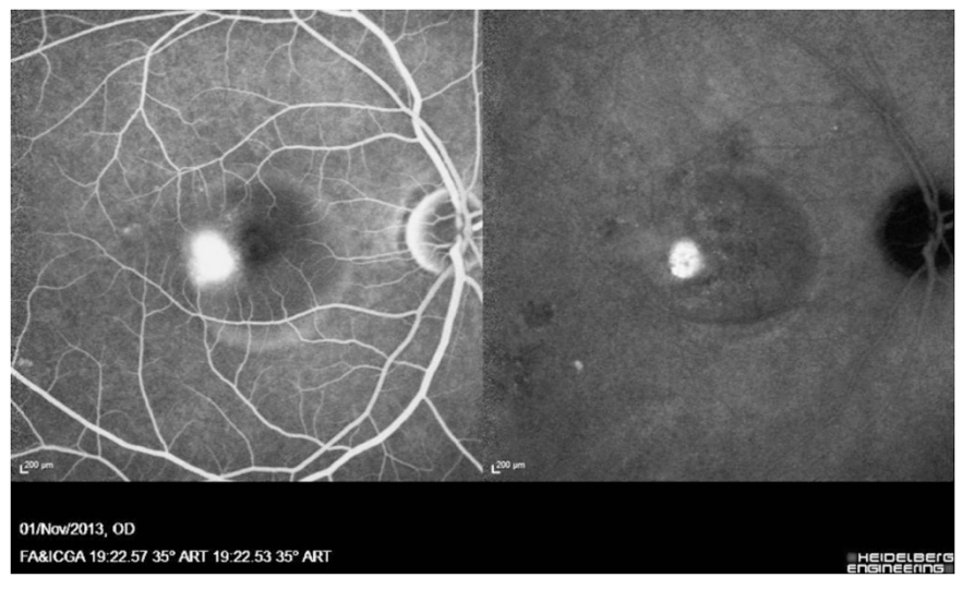
Figure 1 FFA of a patient showing a well-defined juxtafoveal inkblot pattern of about half a disc diameter is seen and corresponding leakage in ICGA demonstrating a hyperdynamic choroidal circulation with hypofluorescent spots indicating choroidal ischemia. Areas of RPE abnormalities are also noted.

This study demonstrates clinical improvement in visual acuity, following SM yellow laser treatment in CSCR as early as 1 week. Furthermore, statistically significant reduction in subretinal fluid height was noted. Patients were observed for a minimum period of 3 months before treatment and thence offered laser therapy at a stage when spontaneous resolution was unlikely. Hence, it is