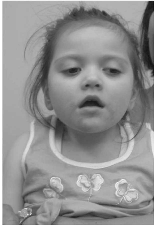
Figure 2 Patient at 3 years and 4 months of age. Photo previously published in Alfadhel et al. 3