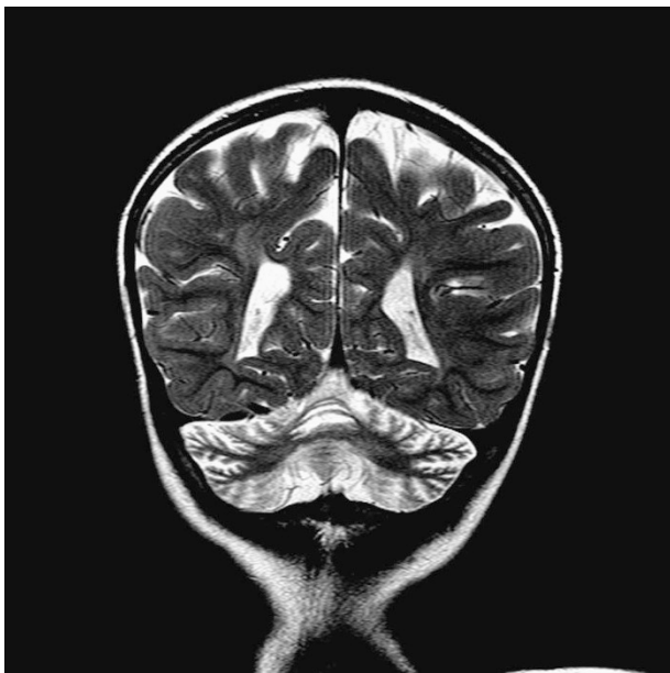
Figure 1 MRI of the brain showing prominent folia of the cerebellar hemispheres and vermis with increased surrounding subarachnoid cerebrospinal fluid indicative of severe symmetrical volume loss of both the cerebellar hemispheres and cerebellar vermis.