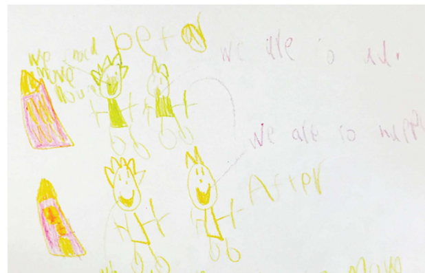
Figure 3 A picture showing the child's family before and after the intervention. In the before picture, the child has written by an image of his home 'we are so sad' and in the after picture the child has written 'we are so happy'.

perceived that being exposed to families with children affected by life-limiting conditions would upset their children.