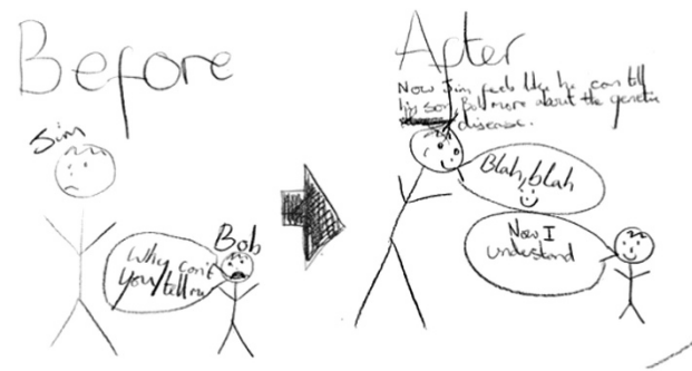
Figure 2 A picture showing a family before and after attending the MFDG intervention. In the before image the child is sad and confused asking their parent "why can't you tell me?" In the after picture the child is happier because he understands what is happening in his family because his parents have been 'able to tell his son a bit more about the genetic disease'.

Logistical challenges such as travel costs and/or child care costs were also seen as a barrier for some families' participation. The most prevalent barrier to attending the MFDG however were parents' anxieties surrounding children's exposure to other IGCs. Parents