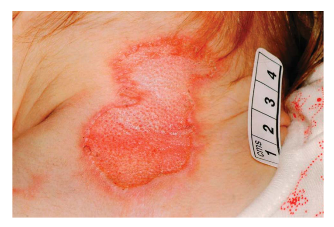
Figure 1 Neck of case 3 with the SCN11A/Na _V 1.9 mutation p.L811P at the age of 1 year 5 months. A large contiguous healing region is shown. This was caused by the child scratching, mostly while awake. This area was excoriated for 6 months due to intense itching for which hyperhidrosis was a significant contributory factor.