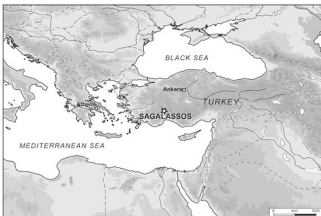
Figure 1 Geographic location of Sagalassos.