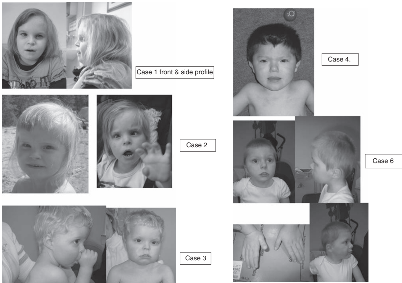
Figure 1 Clinical photographs of five affected individuals with 12q14 deletions. Informed consent was obtained for publication of photographs of cases 1–4 and 6.

previously suffered from constipation. On examination at the age of 7 years and 11 months, her Ht was 101.5 cm ( -4.21 SDS), Wt was 14.2 kg ( -4.42 SDS) and OFHC was 53.2 cm ( +1.13 SDS). Her mother and father are 161 cm and 176 cm tall, respectively. She has relative macrocephaly. Her height velocity has been 3–4 cm per year. Her leg length ( -2.4 SDS) is greater than her sitting height (4.9 SDS). She has a convergent squint, a high nasal bridge, long eyelashes and a cupid's bow. She has clinodactyly and her terminal phalanges are broad. She had fifth finger clinodactyly bilaterally. She has truncal obesity since the age of 10 years, with her weight velocity being greater than her height velocity.