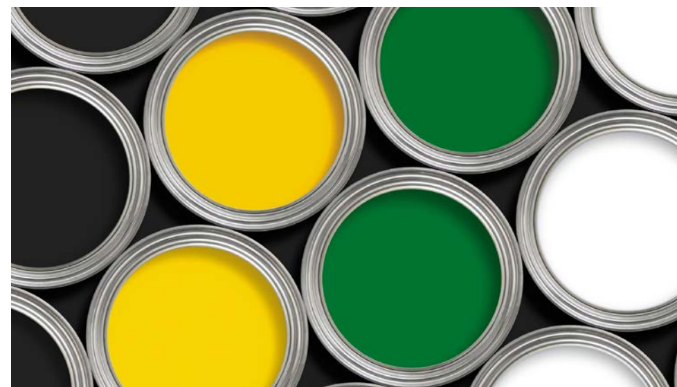
▲ Titanium dioxide products are added to many paints due to their excellent durability, tinting strength and opacity.

To demonstrate how nanoscale shapes can impact pigment properties, Nakao describes ISK’s electroconductive pigments. Rod-shaped particles with special metal oxide treatment have a much higher electrical conductivities than spherical particles. “Customers in the vehicle sector are using our electroconductive pigments in their undercoatings so that they can apply an electrostatic overcoating process,” says Nakao. “Some clients, though, will only use pigments with