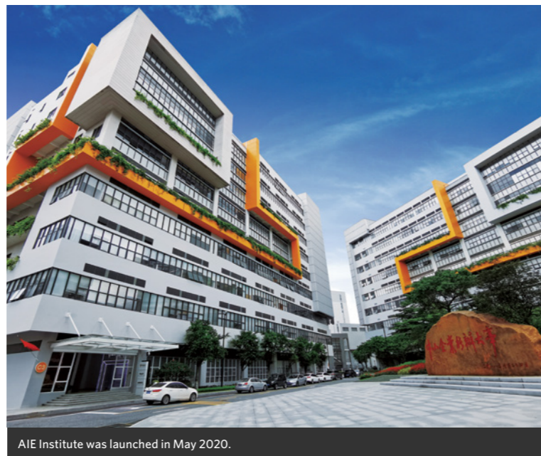
AIE Institute was launched in May 2020.

Exploiting unique materials featuring AGGREGATION-INDUCED EMISSION characteristics, the new AIE Institute in Guangzhou seeks to solve key scientific problems, and drive regional development.