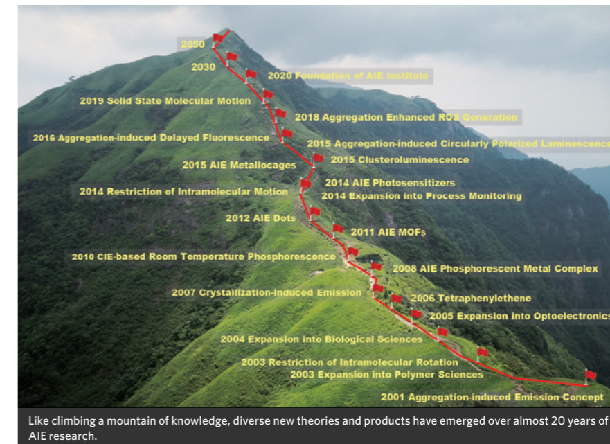
Like climbing a mountain of knowledge, diverse new theories and products have emerged over almost 20 years of AIE research.