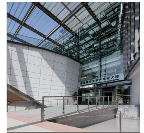
CityU Shenzhen Research Institute is its permanent base for applied research, incubation, and professional education in mainland China.

Another project, led by CityU professor, Fu-Rong Chen, builds infrastructure for the development of next-generation transmission electron microscopes (TEM). The initial focus is on key components for high space/time-resolved TEM. Novel electron optics is being investigated to improve microscopes for a diverse set of experiments and applications, from protein folding and molecular motors, to quantum