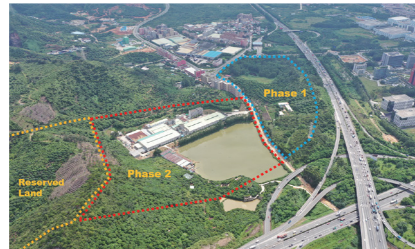
The CityU Dongguan campus area designated in the Guangzhou-Shenzhen Technology Corridor

To enhance its industry impact in the region, CityU