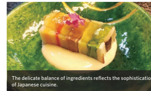
The delicate balance of ingredients reflects the sophistication of Japanese cuisine.