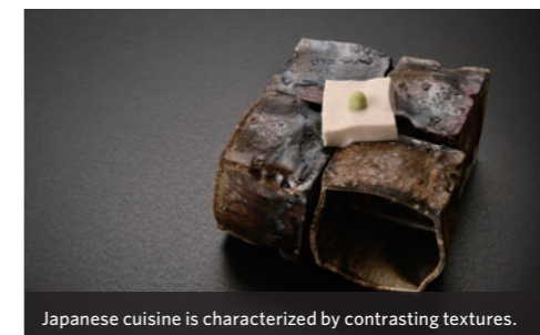
Japanese cuisine is characterized by contrasting textures.

the environmental footprint of food, programme members have discussed the benefits of using more farmed seafood in high-end restaurants. "There's a preconception among Japanese consumers that farmed fish are inferior to ones caught in the wild," says Fushiki. He cites an example of a prestigious restaurant with precise requirements on sea bream used in their dishes, insisting that only females from the Akashi sea area that weigh 2.7 kg are acceptable. Such precision is not reproducible for the succession of culture.