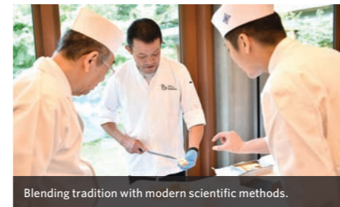
Blending tradition with modern scientific methods.