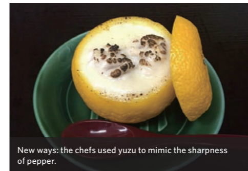
New ways: the chefs used yuzu to mimic the sharpness of pepper.