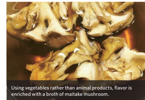
Using vegetables rather than animal products, flavor is enriched with a broth of maitake mushroom.