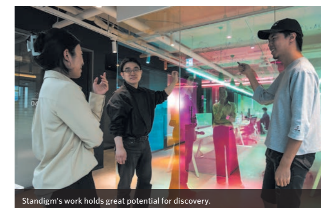
Standigm's work holds great potential for discovery.