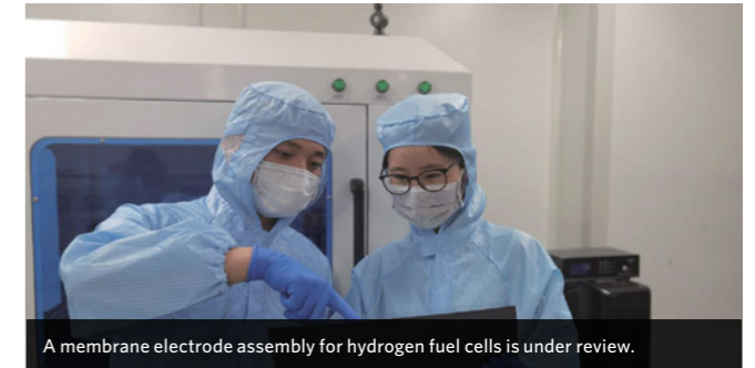
A membrane electrode assembly for hydrogen fuel cells is under review.