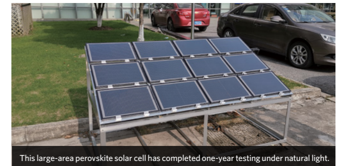
This large-area perovskite solar cell has completed one-year testing under natural light.

systems, supporting the membrane electrode assembly is the key because it facilitates electrochemical conversion of the fuel to electricity. To guarantee high performance and durability for membrane electrodes, while minimizing the use of expensive platinum, Zou's team developed new techniques for catalyst slurry preparation, and precise coating to effectively control the catalyst microstructure, leading to powerful, durable membrane electrodes. With their specially designed equipment, the team has established a membrane electrode mass production line, with annual production capacity of 6,000 m 2 . Products are widely used by domestic enterprises, as well as exported to the United States.