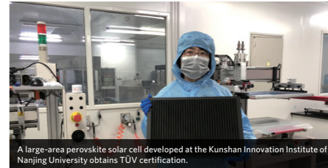
A large-area perovskite solar cell developed at the Kunshan Innovation Institute of Nanjing University obtains TUV certification.