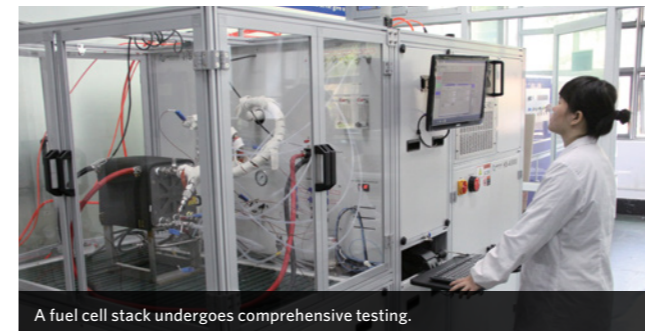
A fuel cell stack undergoes comprehensive testing.