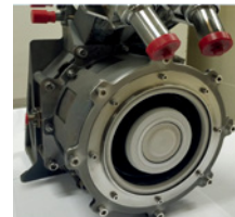
Magnetic focusing Hall thruster developed by HPPL