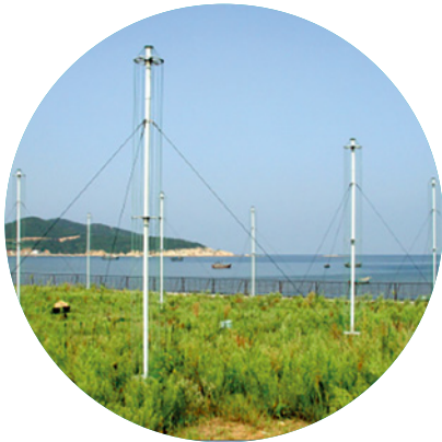
SEIE's marine environmental monitoring technologies allow for remote ocean surface detection.