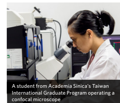
A student from Academia Sinica's Taiwan International Graduate Program operating a confocal microscope

Collaboration is also vital for astronomical and astrophysical studies at AS. Notably, AS's participation in the Event Horizon Telescope (EHT) project has led to capturing the first direct evidence of a supermassive black hole at the heart of a distant galaxy.