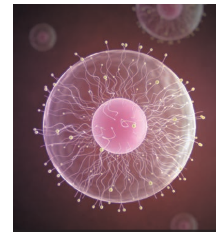
Nanomachines may one day patrol inside the body and carry out treatment from within.