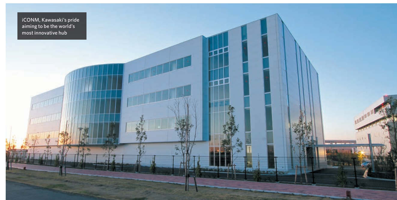
iCONM, Kawasaki's pride aiming to be the world's most innovative hub

to 2020 – about US$228 billion – has often been structured around the 'Society 5.0' objective. And it's understandable why: by 2065, 40% of Japan's population will be older than 65. Innovation will be needed to not only extend working lives and improve well-being, but also reduce the cost of healthcare. In doing this, Japan hopes to create a plethora of new technologies and industries that will revitalize economic growth.