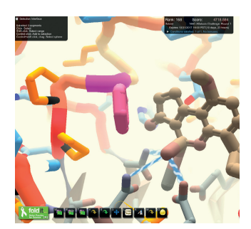
An example of the image that a gamer will see when folding proteins on the Foldit platform.

opportunity to leverage the power of 'the crowd' to explore new protein structures at an expedited rate. One such example is Foldit, an online science crowdsourcing platform that can be played by anyone with a computer and an imagination. It challenges participants to play with 3D protein puzzles that scientists can use to tackle real world medical challenges. Launched in 2008 by David Baker and scientists from the University of Washington, Foldit has already resulted in multiple crowdsourced breakthroughs. For example, in only three weeks gamers solved the structure of an enzyme involved in the reproduction of human immunodeficiency virus (HIV) - a mystery that had stumped scientists for more than a decade<sup>4</sup>. In the past five years, scientists at the University of Washington's Baker Lab have used protein structures fashioned by Foldit participants around the world that act as biosynthetic catalysts<sup>5</sup>, fight coeliac disease<sup>6</sup> and treat anthrax infections7.