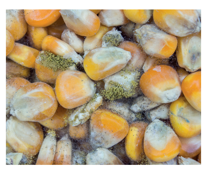
Aspergillus flavus - the fungus that produces aflatoxin - growing on corn.

to be effective. Scientists think an enzyme can be created to attack and degrade aflatoxin, which would decrease toxicity by several orders of magnitude. As a result, a group of uncommon collaborators including Mars, Incorporated, the University of California, Davis, Thermo Fisher Scientific, the University of Washington, Northeastern University, the Partnership for Aflatoxin Control in Africa (PACA) and the United Nations Food and Agriculture Organization (UN FAO) have come together to tap into the power of online, gamified protein folding with hopes that it can expedite progress towards a solution.