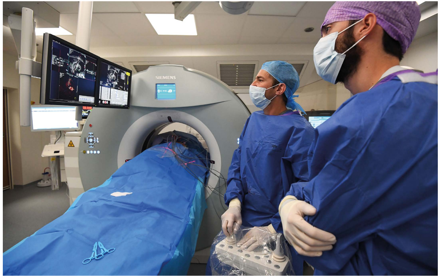
Getting access to samples will become increasingly important as approaches for the molecular profiling of tumours improve.