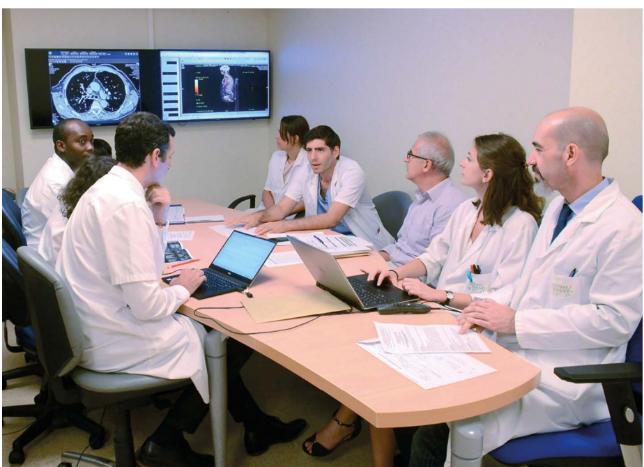
Physicians can identify molecular targets in individual cancers and decide on treatments.

Since 2020, societies such as ESMO have recommended that all individuals with advanced lung cancer undergo multigene testing<sup>10</sup>. Yet, a study involving around 38,000 patients with this condition in the