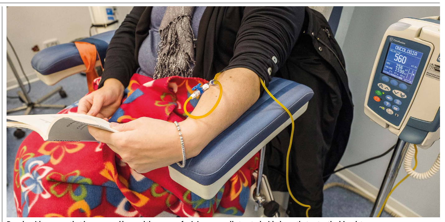
People with cancers that have spread beyond the organ of origin are usually treated with drugs that enter the bloodstream.

United States, who were diagnosed between 2010 and 2018, showed that only 22% had molecular test results in their medical record. This is consistent with findings from other studies, conducted both in the United States and elsewhere<sup>11,12</sup>.