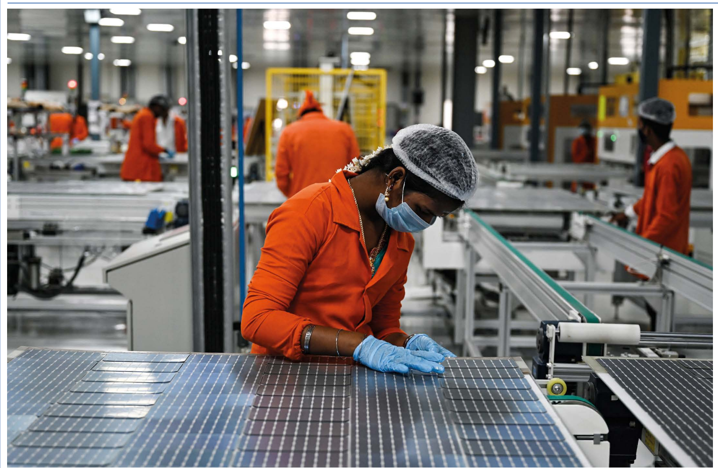
Workers at the Vikram Solar manufacturing plant at Oragadam in Tamil Nadu, part of India's push to use solar power.