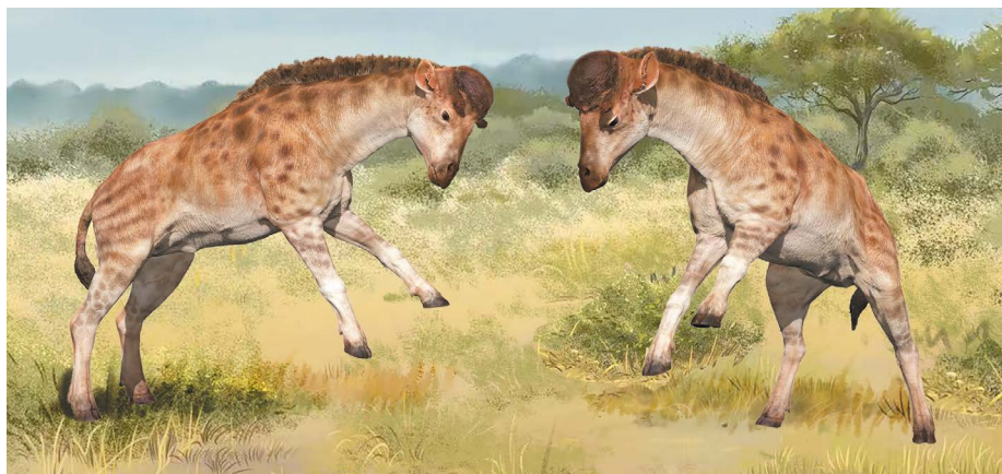
An artist's impression of Discokeryx xiezhi , which had a thick headpiece adapted for fighting.