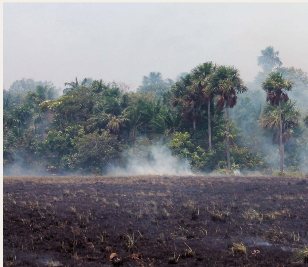
Wildfires are becoming more frequent in the Orinoquía region of Colombia.

A third function is direct action. Scientists for XR groups have been involved in a number of XR events. For example, at the 2021 opening of a London Science Museum exhibition sponsored by oil and gas company Shell, some scientists locked themselves to parts of the exhibition in protest against the sponsorship, while our group set up a table outside to demonstrate principles of atmospheric cooling and engage with the public. Such events serve to highlight the issue of science museums accepting sponsorship from fossil-fuel companies.