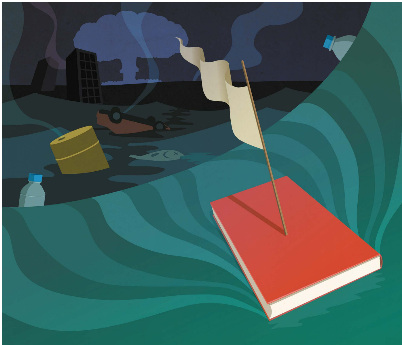
ILLUSTRATIONS BY RICHARD WILKINSON