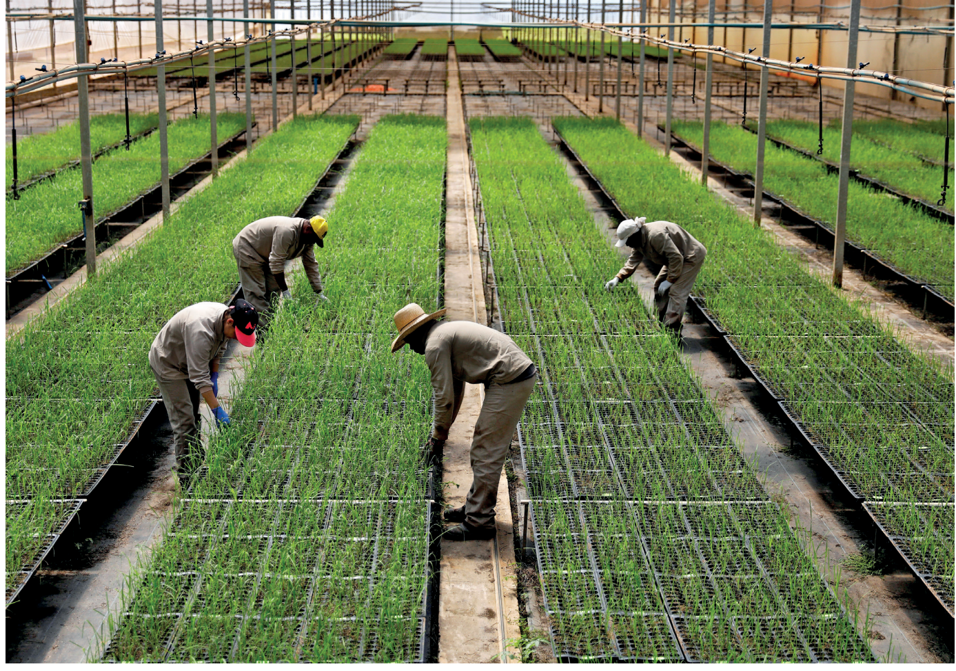
São Paulo supplies more than half of Brazil's sugar cane, which is used to produce ethanol fuel for the car industry.