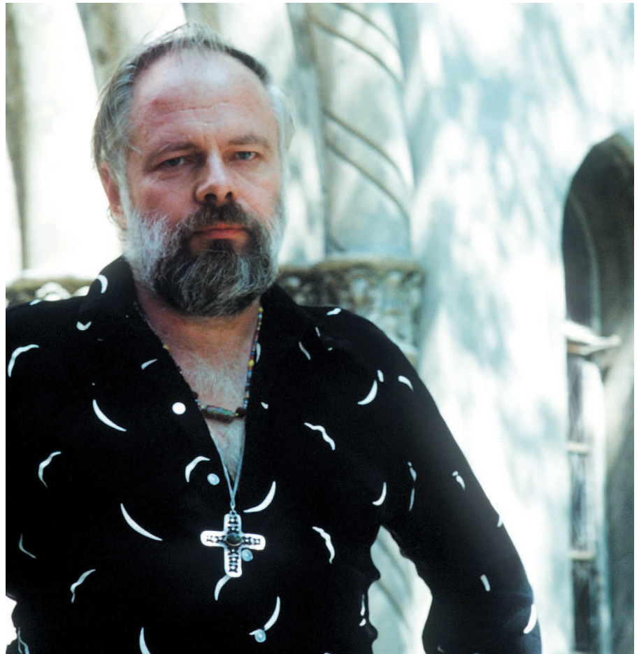
Philip K. Dick, pictured in 1982.

Many know of the book solely through the film. But Blade Runner is only nominally based on the original. Dick's prescience in ▶