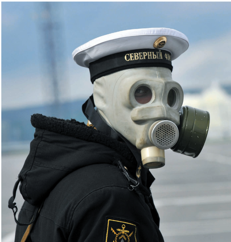
A serviceman from Russia's chemical, radiological and biological weapons defence unit in 2016.