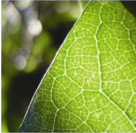
JULES MONTGOMERY / VAGCREATIVA