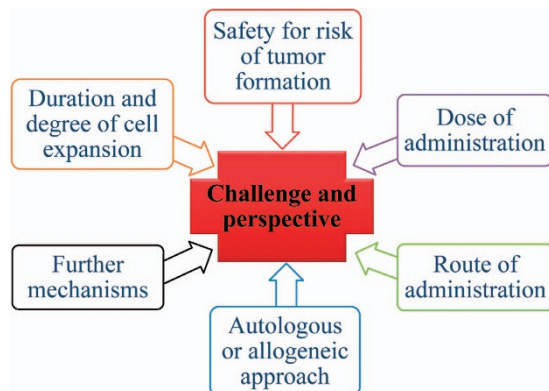
Figure 3. Challenges for clinical application of MSCs to treat diabetic neuropathy.

A major challenge is the large-scale production of MSCs under GMP conditions and issues of MSC heterogeneity. The duration and degree of cell expansion and culture has an impact on MSC morphology, differentiation, viability, and migratory properties. MSCs not only undergo phenotypic changes in culture and during passage (size, morphology, and cell surface marker expression) 75 but also lose capacity for functional proliferation and differentiation potential. 75,76 In addition, their ability for cytokine production is altered. 76 Thus a delicate balance between culture expansion to gain sufficient numbers of MSCs for therapeutic application and long-term culture effects needs to be met. Tightly controlling the microenvironment of MSCs is required. Detailed investigations of how the microenvironment affects the immunosuppressive effects of MSCs are still lacking and are required as cell-to-cell contact and