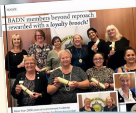
Long service recognition p31