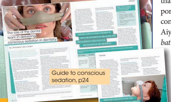
Guide to conscious sedation, p24