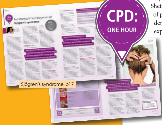
Sjögren's syndrome, p17