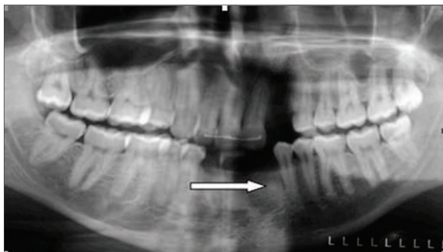
Fig. 2 Presurgical panoramic radiograph of adult Dinka male showing tip of retained left mandibular canine

Emitting neither tears nor sounds, he was not restrained. He sat upright, his head 'squeezed' between the knees of the well-known village extractor or raan de hoth . Using a procedure similar to that described above, the mandibular incisors were luxated at the midline using a finger-sized spear, narrow and sharp at the end. Once the teeth were loosened, the extractor 'dug' on the lingual side of the child's gingival tissue and the teeth were 'popped' out. The boy rinsed with boiled hot water and used his tongue to clean the wound 'so that it would be smooth'. Later he was given boiled hot milk.