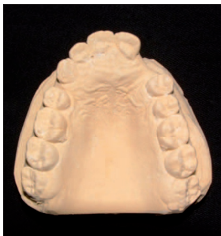
Fig. 3 Occlusal view of dental cast showing presurgical placement of maxillary teeth with missing right lateral premolar, left lateral incisor, and left canine

alveolar bone in this area. The forthcoming dental restoration will restore the dental aesthetics of this patient to a Western standard.