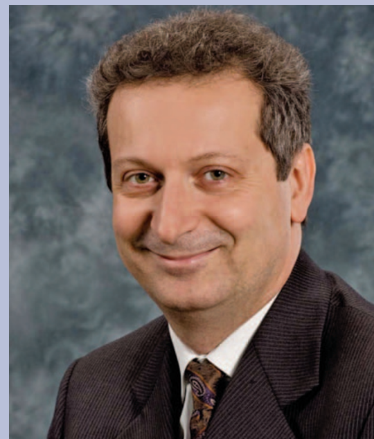
Professor of Biomaterials at the Sahlgrenska Academy, University of Göteborg, Sweden.