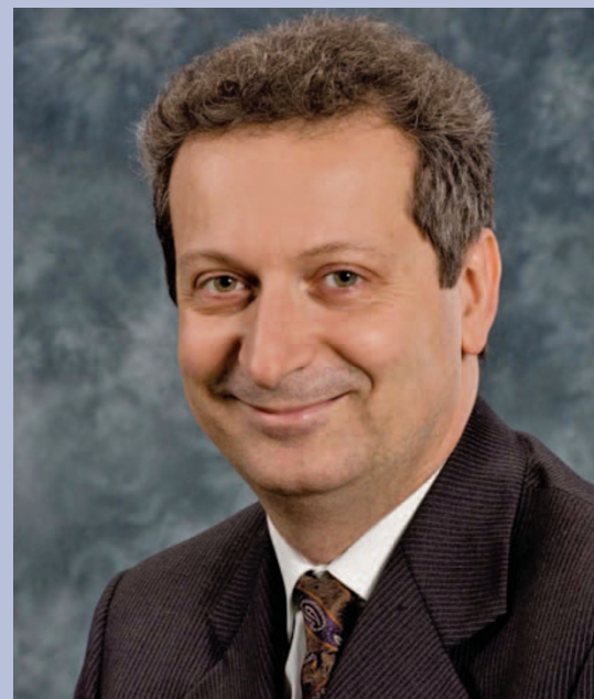
Professor of Biomaterials at the Sahlgrenska Academy, University of Göteborg, Sweden.