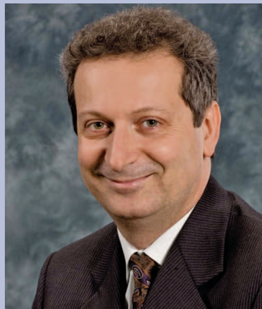
Professor of Biomaterials at the Sahlgrenska Academy, University of Göteborg, Sweden.