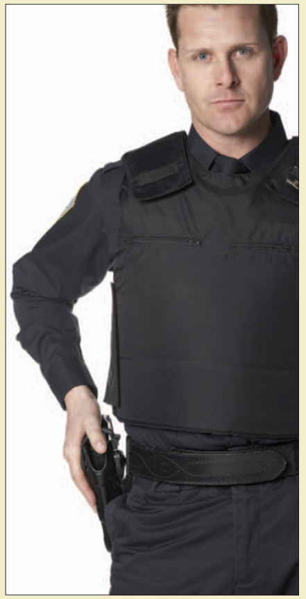
Polyethylene fibres used in bullet-proof vests can quadruple toughness of dental composites, according to the report.

"The tests required by the FDA indicate that fibre-reinforced composites are safe, but those tests are only partially informative. Our analyses show that we can optimise these materials to match and improve performance of teeth, for greater durability, toughness, and resistance to breakage."