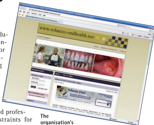
The organisation's website invites visitors to develop programs to promote tobacco use prevention and cessation for their patients

The Network was developed to support a global collaborative forum to establish and augment national and international expertise in areas including assisting oral health professionals to implement tobacco use prevention and cessation in the daily practice and integrating tobacco use prevention and cessation into dental and dental hygiene education.