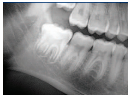
Fig. 1 Orthopantomograph showing 'double teeth' mandibular right third molar

Sir, we would like to share with your readers an unusual case of a patient with double teeth. The 18-year-old male presented with inflammatory episodes in the right molar area, in relation to the partially erupted right third molar. Clinical and radiographic examination revealed gemination of the right third mandibular molar (Fig. 1). This tooth was removed entirely under local anaesthesia without odontosection (Fig. 2).