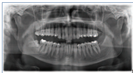
Fig. 1 Carious lesion on the distal of the LR7 which led to the teeth having a periapical infection

Sir, doctors and medical students have been shown to be inadequately educated about oral diseases. 1 This has dire consequences, not only for their patients but also for themselves. We report a case of a final year medical student who complained of a dull, aching pain on the lower right quadrant of the mandible. The pain was initiated by hot, cold and sweet stimuli. He ignored the advice of his fellow colleagues to seek dental treatment and subsequently self-medicated with a generic sodium fluoride mouthwash and ibuprofen. Pain relief was achieved, albeit temporarily which resulted in him bragging that a dental appointment was unnecessary. However, four weeks later, he developed