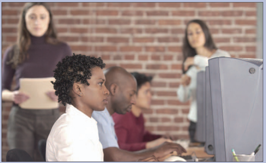
A link has been found between country of origin and oral health

an Associate Professor of Epidemiology and Health Promotion and Director of Global Oral Public Health at NYU, undertook the study on the oral health of immigrants to the United States, analysing caries and periodontal disease rates in over 1,500 Chinese, Haitian, Indian, West Indian, Puerto Rican, Dominican, and Central and South American immigrants of Hispanic origin living in New York City.