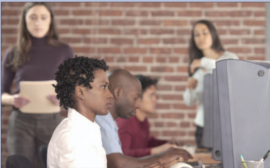
A link has been found between country of origin and oral health

an Associate Professor of Epidemiology and Health Promotion and Director of Global Oral Public Health at NYU, undertook the study on the oral health of immigrants to the United States, analysing caries and periodontal disease rates in over 1,500 Chinese, Haitian, Indian, West Indian, Puerto Rican, Dominican, and Central and South American immigrants of Hispanic origin living in New York City.