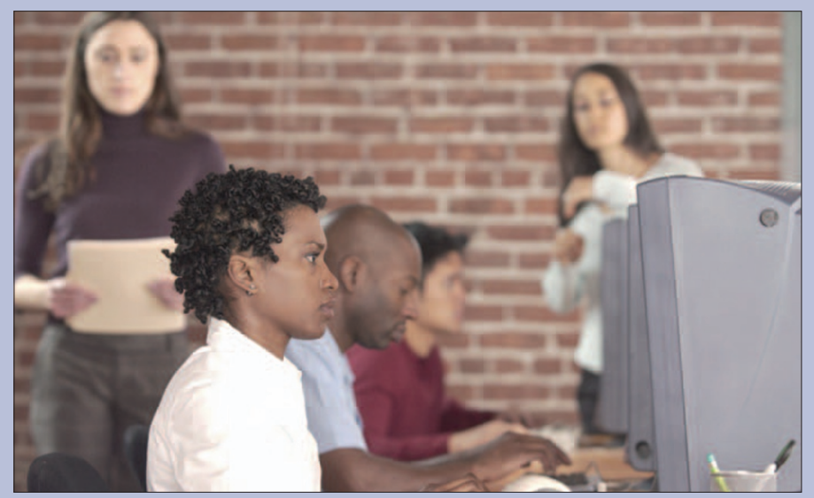
A link has been found between country of origin and oral health

an Associate Professor of Epidemiology and Health Promotion and Director of Global Oral Public Health at NYU, undertook the study on the oral health of immigrants to the United States, analysing caries and periodontal disease rates in over 1,500 Chinese, Haitian, Indian, West Indian, Puerto Rican, Dominican, and Central and South American immigrants of Hispanic origin living in New York City.