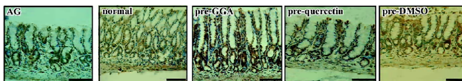
Figure 3. Immunohistological analysis of HSP70 distribution after treatment with GGA or quercetin in rats with atrophic gastritis. HSP70 was more frequently recognized in the nucleus and cytoplasm after intervening treatment with GGA. Quercetin inhibited the expression of HSP70 in the nucleus. Bar =0.1 mm. AG, rats with atrophic gastritis; pre-GGA, treatment with GGA; pre-querctetin, treatment with quercetin; pre-DMSO, treatment with DMSO (vehicle).

in both the nucleus and cytoplasm, but in the quercetin-treated rats, HSP70 was mainly recognized in the cytoplasm of the cells at crest of gastric mucosal folds, which was less frequent than that in the vehicle control (Figure 3).