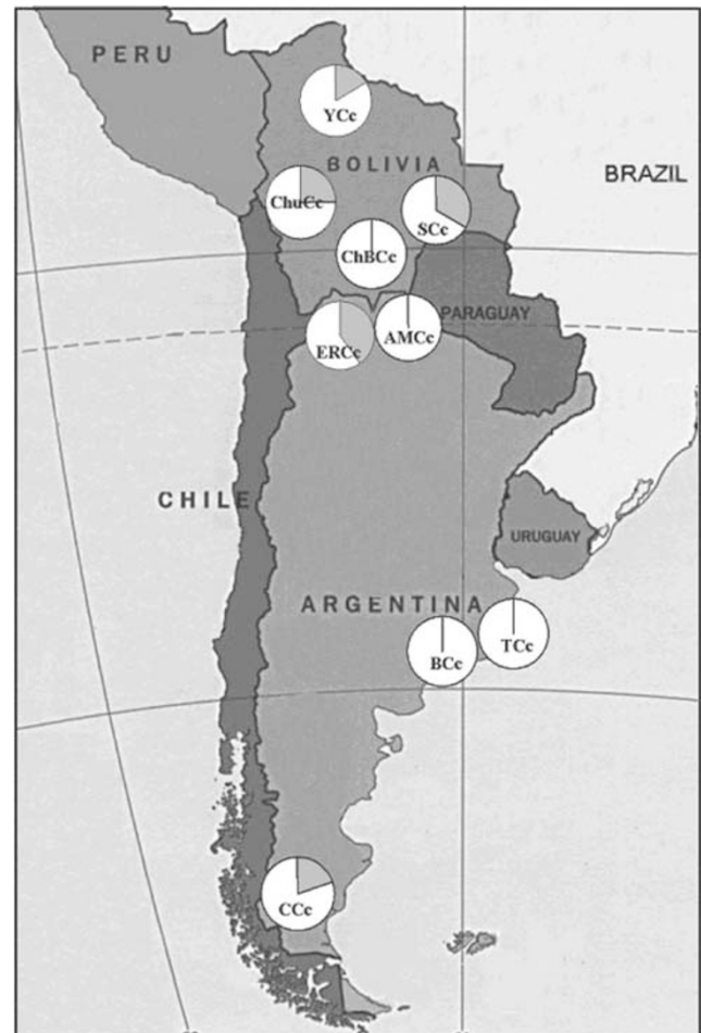
Figure 1 Map showing the populations of Argentinean and Bolivian cattle examined. The proportion of African haplotypes in each sample is illustrated by the filled sectors of the pie charts. YCc: Yacumeño breed, ChuCc: Chusco breed, SCc: Saavedreño breed, ChCc: Bolivian Chaqueño, ERCc: El Remate, AMCc: Arroyo del Medio, BCc: Balcarce, TCc: Tandileufú, CCc: Calafate.

Total DNA was extracted from blood samples using the DNAzol purification kit (Gibco Life Technologies, Rockville, MD, USA) following the manufacturer's instructions. Animals were preselected before sequencing by PCR-SSCP analysis to include a range of genetically distinct individuals. The PCR primers used were SSCPG3.F and SSCPG4.R (Eledath and Hines, 1996), which amplify a 489-base-pair fragment of the D-loop. The 50 µl reaction mix contained approximately 100 ng of total DNA, 0.5 µM of each primer, 0.1 mM of dNTPs and 2 U of Taq polymerase (Gibco Life Technologies, Rockville, MD, USA) in 20 mM Tris-HCl (pH 8.4), 50 mM KCl and 2 mM MgCl 2 , under mineral oil. The PCR consisted of a first denaturation step at 94°C for 2 min followed by 30 cycles of 45 s at 94°C, 1 min at 50°C and 1 min at 72°C, with an elongation step of 5 min at 72°C in the last cycle. For the SSCP analysis, 15 µl microliters of each PCR product was added to 40 µl of dye LIS (10% sucrose, 0.01% bromophenol blue and 0.01% xylene cyanol FF).