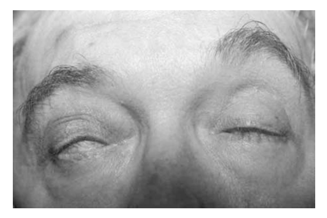
Figure 4 Spastic Bell's phenomenon noted after right-sided brow suspension surgery.

is a subgroup of patients with facial dytonias in whom the eyeballs roll up under the upper eyelids making them functionally blind even though the eyelids are open and the spasm of the orbicularis muscles has been reduced. These patients are offered systemic centrally acting medication such as clonazepam to try and control this spastic Bell's phenomenon. If the patient does tolerate ptosis props, a brow suspension procedure is offered using a material that is easy to remove such as a supramid prolene suture, so that it can be easily reversed if the surgery is poorly tolerated.