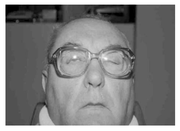
Figure 3 Trial of ptosis props for pretarsal spasm.

Sometimes, pretarsal spasm cannot be controlled without weakening the levator palpebrae superioris and changing a ptosis due to orbicularis spasm for one due to levator paralysis. In these patients, our protocol is to control the spasm with as much botulinum toxin as is required, and to treat the resultant paralytic ptosis with a brow suspension after a trial of ptosis props (Figure 3). The trial of ptosis props is to identify those patients who will not be helped by a brow suspension due to either dry eyes or a spastic Bell's phenomenon (Figure 4). There