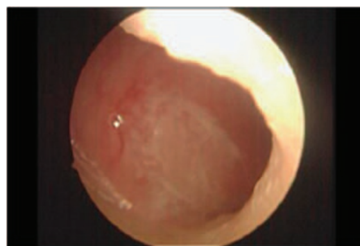
Figure 2 Nasal septum irritation.

One had crusting and infection of nasal mucosa. The total dose received at the time of nasal perforation diagnosis was 45, 105, 120, 150 and 225 \text{ mg kg}^{-1} , respectively.