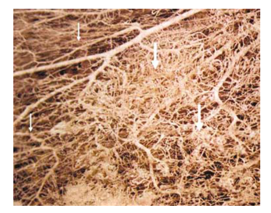
Figure I Architectural difference between vasculature in normal (small arrows) and tumour tissue (thick arrows).

Combretastatin A4 phosphate is a water-soluble prodrug of combretastatin A4 (CA4). Following administration, CA4P is rapidly cleaved to CA4 and binds tubulin at or close to the colchicines-binding site (McGown and Fox, 1989). One of the first in vivo studies showed rapid, extensive and irreversible vascular shutdown and haemorrhaghic necrosis following a single dose of CA4P. A pronounced and sustained reduction in functional