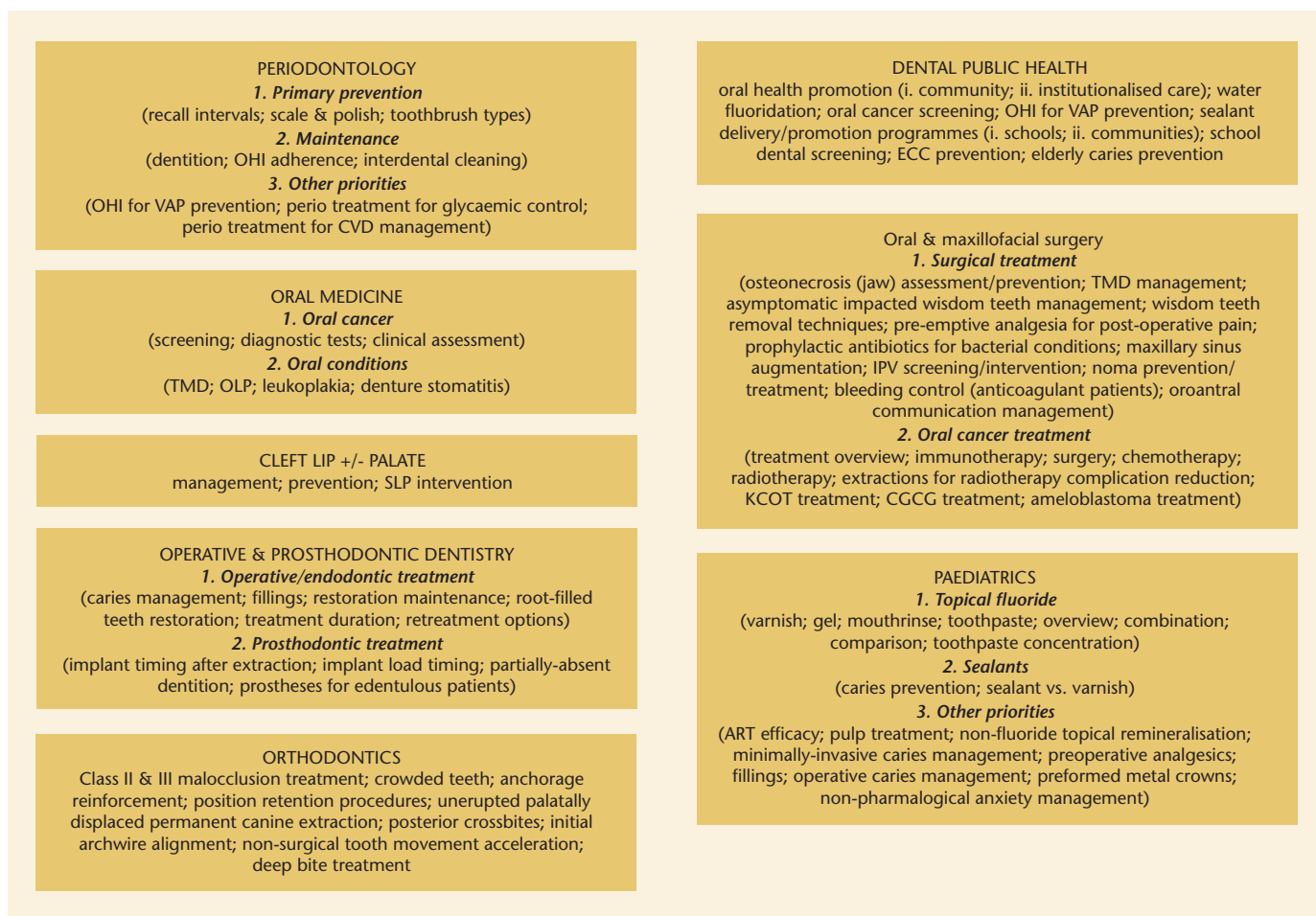
Figure 1. Spread of reported oral health concerns to inform decision-making